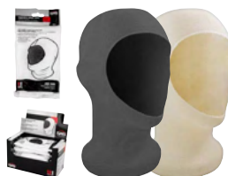
Deluxe Standard Individually packaged for re-sale